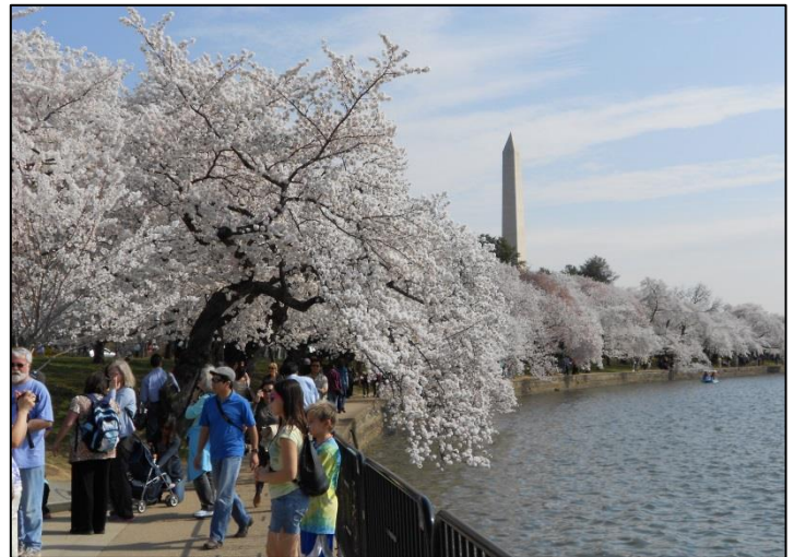
Visitors to the Cherry Blossom festival in Washington, DC. The timing of flowering is advancing with warming temperatures.

The National Park Service is beginning its second century of preserving America’s natural and cultural heritage and providing for visitor enjoyment. The coming decades are likely to see continuing changes in climate and phenology. Parks will need to adapt to both the challenges and opportunities posed by these changes.