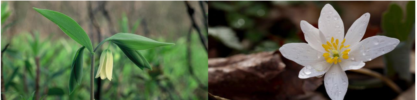
Leaves unfurling and blossoms opening in spring at Shenandoah National Park.