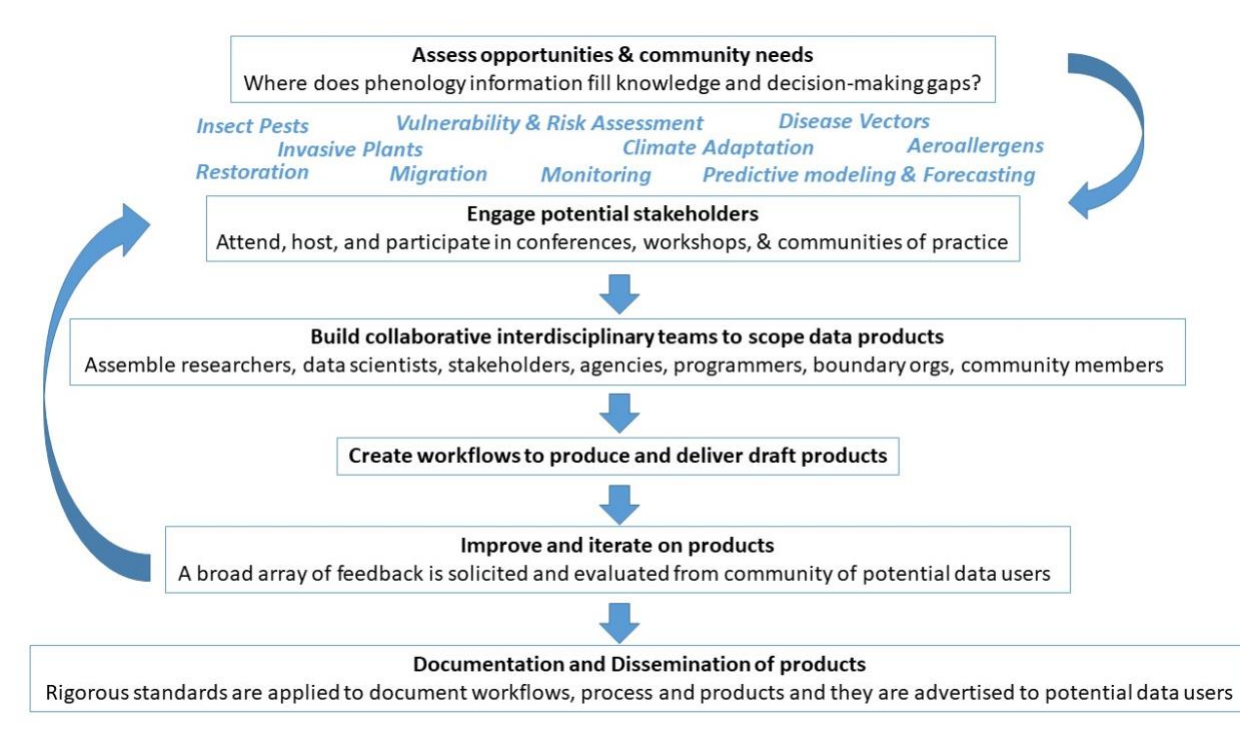
Figure 1: USA-NPN framework for developing data products that meet stakeholder needs.

The USA-NPN is currently focusing on several topical areas of management concern where relevant and timely phenological information can improve short-term decision-making and long-term planning. These topical areas include insect pests, invasive plants, aeroallergenic plants, and migratory birds. We are also working with agency partners on the topic of future changes in spring arrival as a facet of climate adaptation.