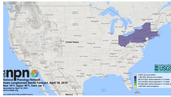
Figure 3. Asian longhorned beetle Pheno Forecast, April 18, 2019. Colors indicate the status of adult emergence. Dark purple indicates not yet approaching adult emergence, dark blue-green: adults expected to emerge in 2-3 weeks, dark green: adults expected to emerge in 1-2 weeks, light green: adults expected to emerge in seven or fewer days, yellow: adults emerging.

Sign up to receive advance warning by email of activity in your pest of interest 2 weeks, and 6 days, before the predicted life cycle stage is reached at your location. Sign up to receive notifications for any of the Pheno Forecasts at www.usanpn.org/data/forecasts.