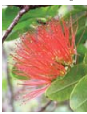
" Plant phenology in Hawai'i and other tropical islands may be linked more directly to rainfall regimes along elevation gradients than average air temperatures."

allergy seasons, public visitation to National Parks, and cultural festivals. Change in phenology, recognized as a bio-indicator of climate change impacts, has also been linked to increased wildfire activity and pest outbreak, shifts in species distributions, spread of invasive species, and changes in carbon cycling in forests. Phenological information can and already is being used to identify species vulnerable to climate change, to generate computer models of carbon sequestration, to manage invasive species, to forecast seasonal allergens, and to track disease vectors, such as mosquitoes and ticks, in human population centers.