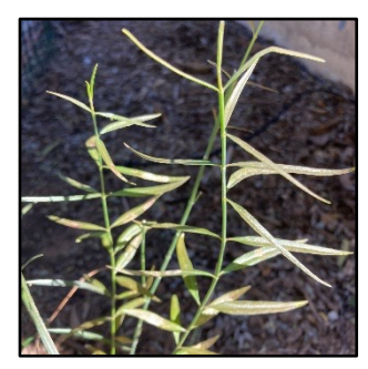
Erin Posthumus. <u>CC BY-NC-SA 4.0</u>

New growth of the plant is visible after a period of no growth (winter or drought), either from above-ground buds with green tips, or new green or white shoots breaking through the soil surface. Growth is considered "initial" on each bud or shoot until the first leaf has fully unfolded. For seedlings, "initial" growth includes the presence of the one or two small, round or elongated leaves (cotyledons) before the first true leaf has unfolded.