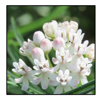
Kim Pegram. <u>CC BY-NC-SA 4.0</u>

One or more live, fully unfolded leaves are visible on the plant. For seedlings, consider only true leaves and do not count the one or two small, round or elongated leaves (cotyledons) that are found on the stem almost immediately after the seedling germinates. Do not include fully dried or dead leaves.