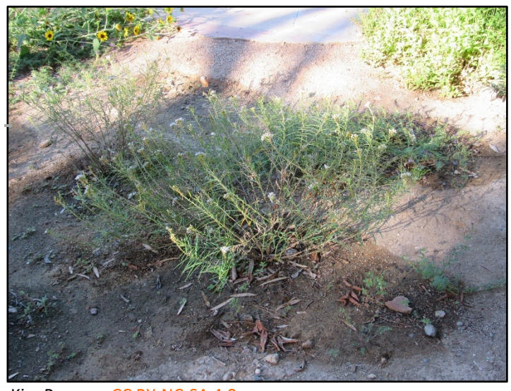
Kim Pegram. CC BY-NC-SA 4.0