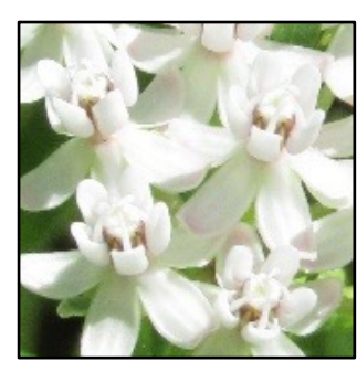
Kim Pegram. <u>CC BY-NC-</u> SA 4.0

One or more fresh open or unopened flowers or flower buds are visible on the plant. Include flower buds or inflorescences that are swelling or expanding, but do not include those that are tightly closed and not actively growing (dormant). Also do not include wilted or dried flowers.