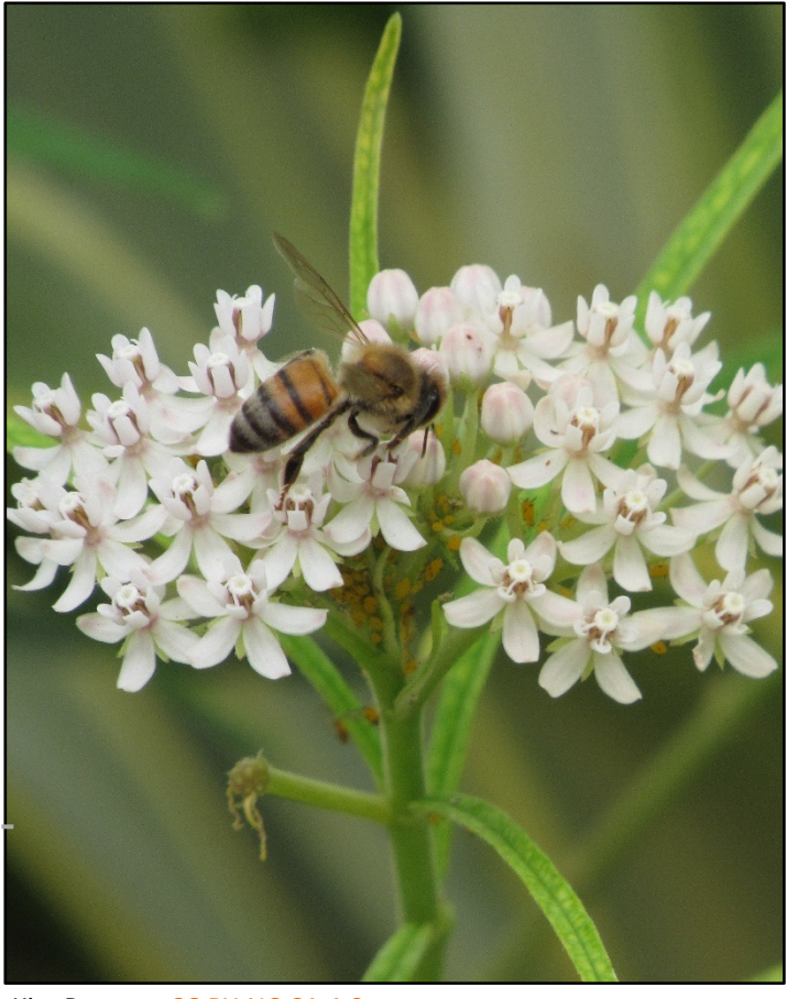
Kim Pegram. CC BY-NC-SA 4.0

Be aware there is variation from individual to individual within a species, so your plant may not look exactly like the one pictured. If you are uncertain whether or not a phenophase is occurring, report a "?" for its status until it becomes clear what you are observing after subsequent visits.