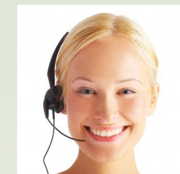
Skype call-in hours and observer support