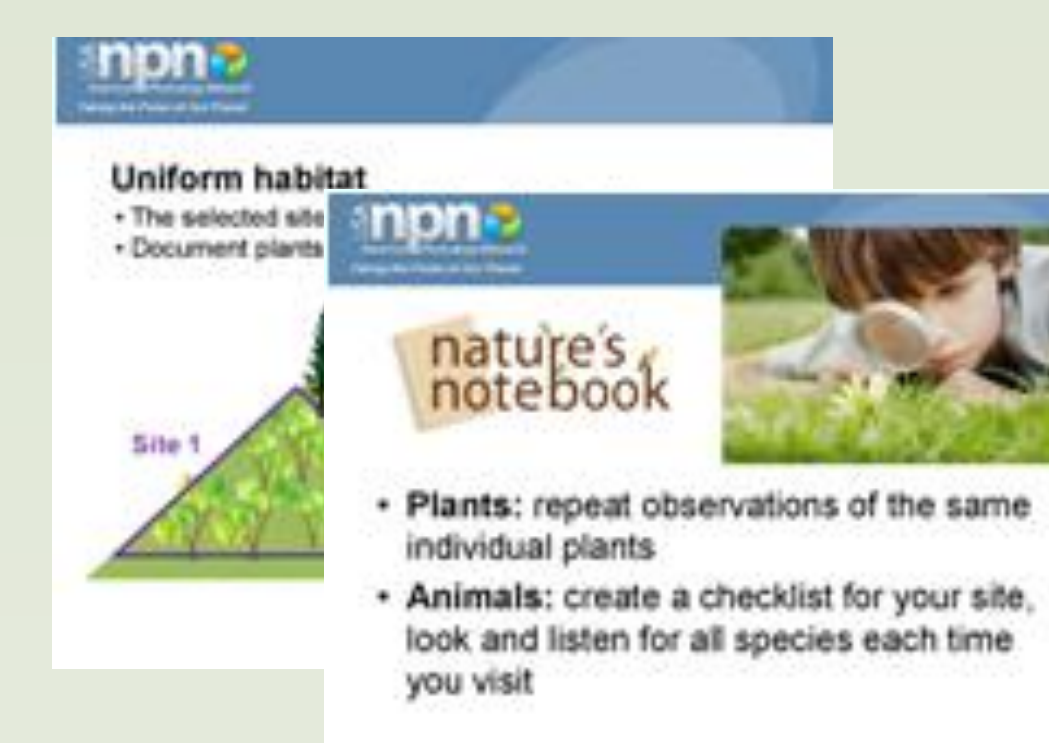
Scripted training presentations (PowerPoint files) and voiced training videos