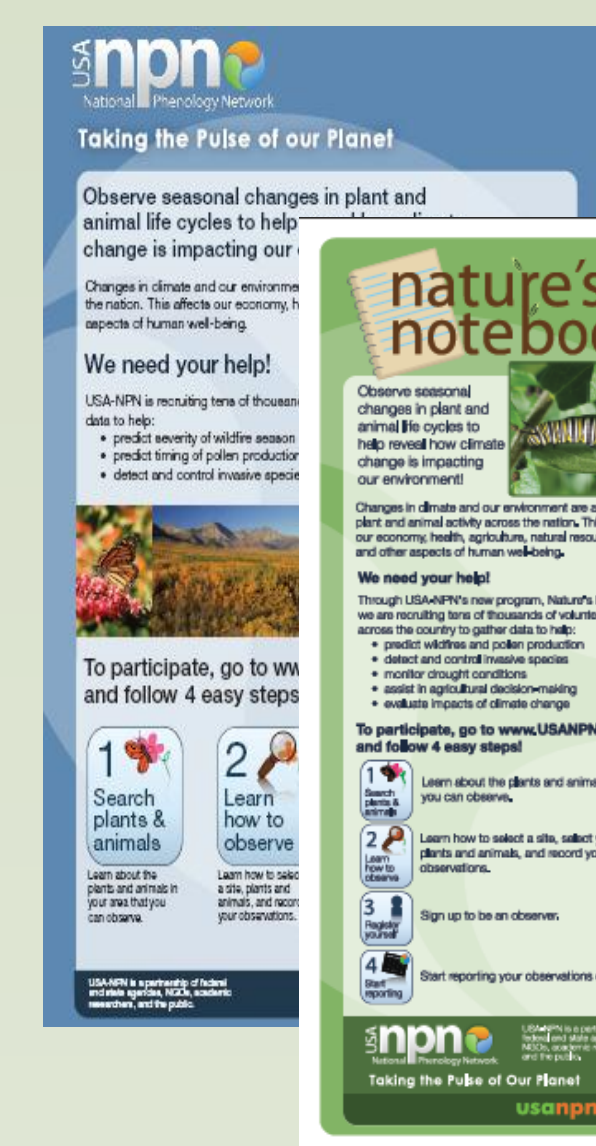
Flyers, posters, and handouts

Extensive support and training materials are available on the USA-NPN website ( www.usanpn.org/resources/resources ):